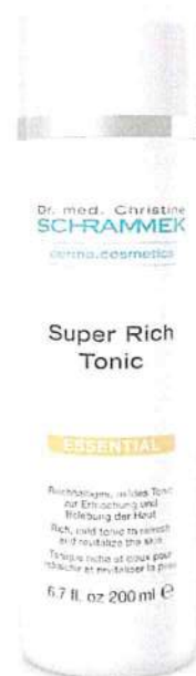
Salat: Art. no 414005, 200 ml bottle Salort: Art. no 514005, 500 ml dispenser