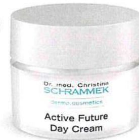
Size: Art.no 545210, 50ml jar Retail: Art.no 545200, 125ml tube