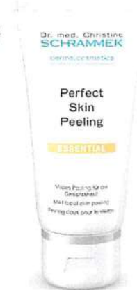
Sale: Art.no 422425, 50ml tube Salon: Art.no 525423, 125ml tube