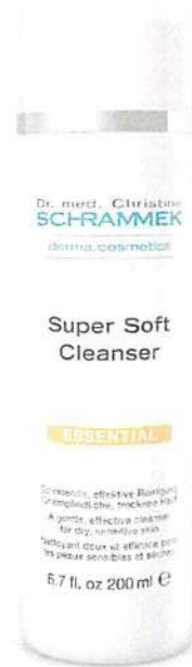
Salat: Art. no 412005, 200 ml bottle Salort: Art. no 512005, 500 ml dispenser