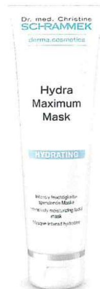
Sale: Art. No. 474000, 75 ml tube Salzn: Art. No. 574000, 135 ml tube