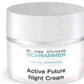
Size: Art.no 442300, 50ml jar