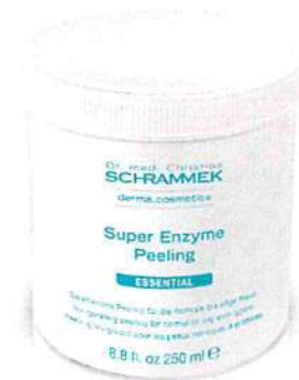
Skincare: Art.No.511033, 250g/9.1

Tip: In case of sensitive skin, we recommend to add some yield oats flakes to the peeling in order to soften the strong effects of the enzymes.