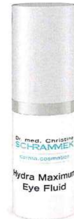
Sale: Art. No. 473000, 15 ml dispenser Salzn: Art. No. 573000, 50 ml dispenser