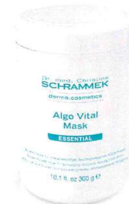
Skincare: Art.No.521020, 300g/10.6

Tip: For a decongesting effect, the mask should take effect for 8-10 minutes only. This treatment is suitable for very sensitive skin and even rosacea. If the application time is prolonged, the mask has a stimulating and revitalizing effect (this treatment is no longer suitable for rosacea).