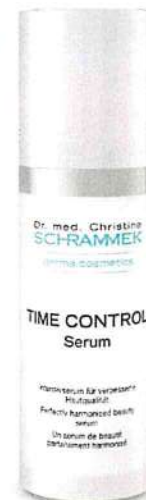
Bezeichnung: Artikelnummer: 433000, 30 ml/1.0 fl. oz. Gelbrot: Artikelnummer: 432000, 50 ml/1.7 fl. oz.