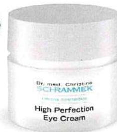
Salz: Art.Nr. 460 000, 15ml jar Salz: Art.Nr. 560 000, 50ml jar