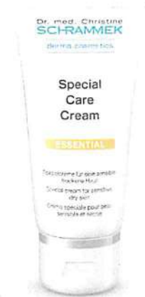
Salz: Art.Nr. 454 000, 50ml tube Salz: Art.Nr. 554 000, 125 ml tube