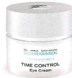
Bezeichnung: Artikelnummer: 433000, 15 ml/0.5 fl. oz.