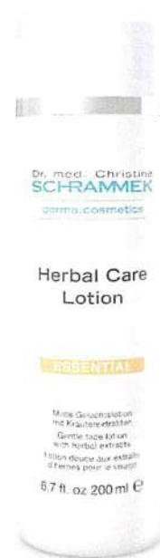
Sale: Art.no 462031, 200ml bottle Salon: Art.no 652039, 500ml dispenser