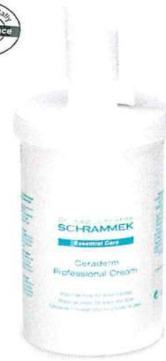
Skincare Art, no. 594900, 300 ml Dispenser